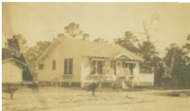
White house at 3008 54 th Street