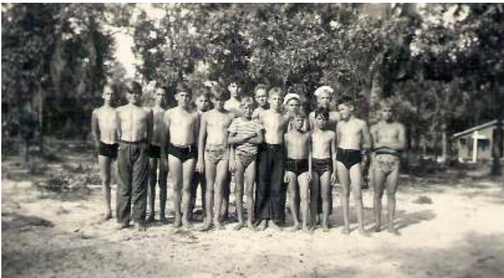
Troop 15, 1930s