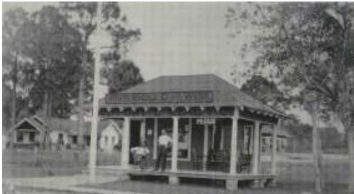
Wintersgill and Webb Real Estate Office on lower Beach