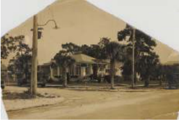
Webb & Yates real estate office, corner of Beach Boulevard and 29 th Avenue

Wintersgill and Webb Real Estate office on lower Beach Boulevard