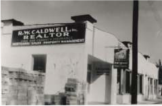
Caldwell's office on Shore Blvd.