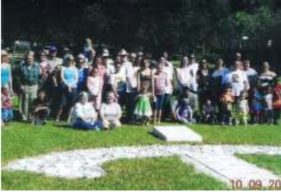
Fussell family at dedication of sun clock, October, 2010