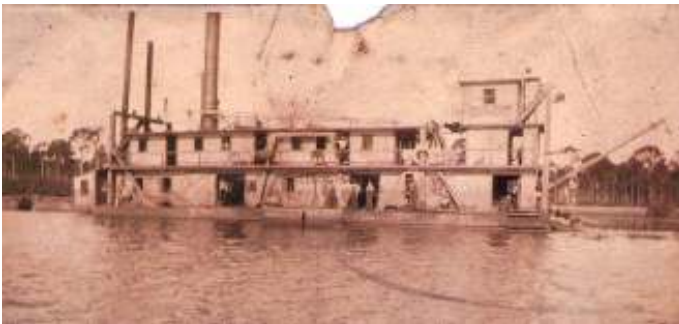
The Clausen Dredge