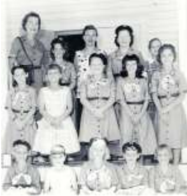
April's Girl Scout Troop, 1950s

The Camp Family See also City Officials, Boca Ciega Inn