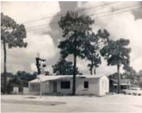
Caldwell's office on Gulfport Blvd.