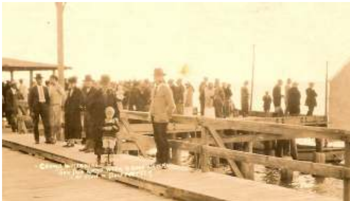
Waiting for the “Sea Dog” to arrive