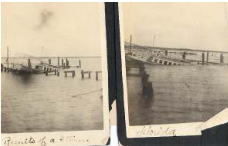
The “Florida” after the 1921 hurricane

Plus photocopy of a picture of the Shell Island Boat, “Miss Florida” which may or may not be the same