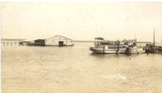
The old Boca Ciega Yacht Club with the “Gypsy” and the “Joe”