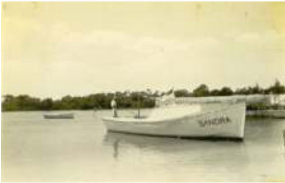
With builder Courtney Sawyer