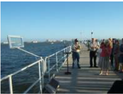
Dedication of the Plaque, April 4, 2008

CD with photos from St. Petersburg Historical Museum