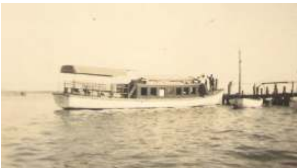
Unidentified party boat

Plus several photos that may or may not be of Gulfport boats, and several color snapshots of modern boats