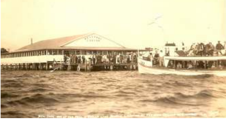
The “New York” and Second Casino