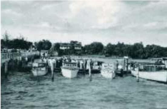
The party boat dock