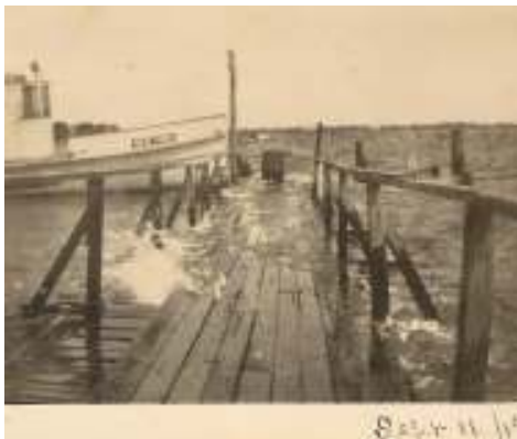
The “New York” September, 1919