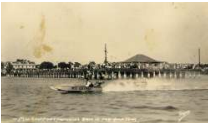
“Winning race in her home town”