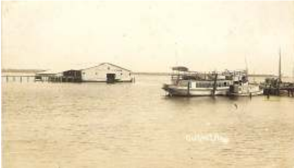
The early Boca Ciega Yacht Club with the Gypsy and the Joe